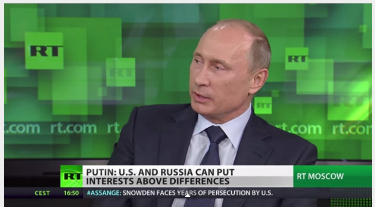
Vladimir Putin in a 2013 RT interview.