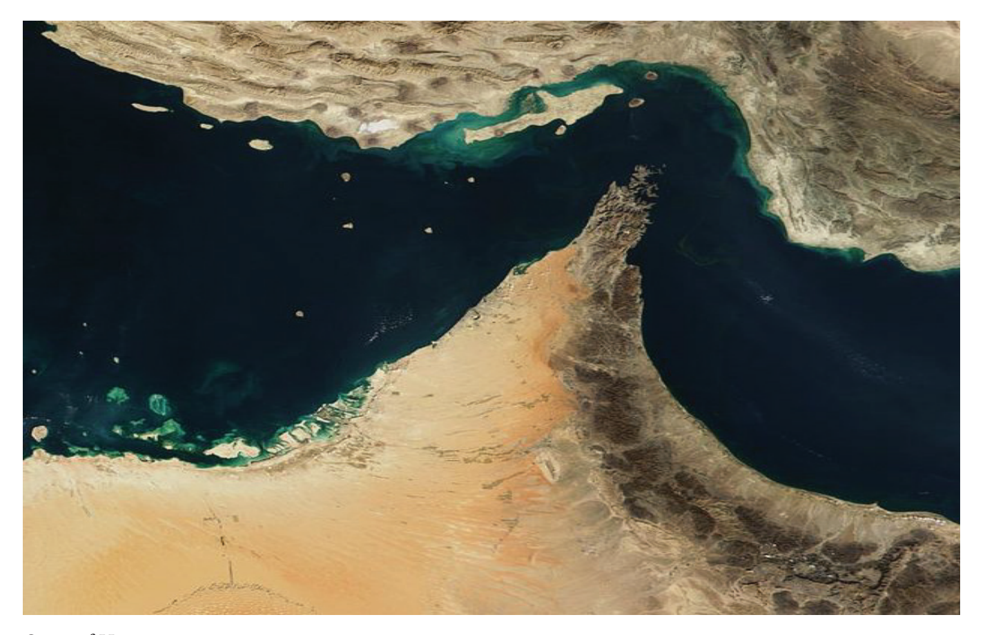
Strait of Hormuz

Resources: CIA World Factbook, US Department of State, PBS, IISS Military Balance 2011, World Bank