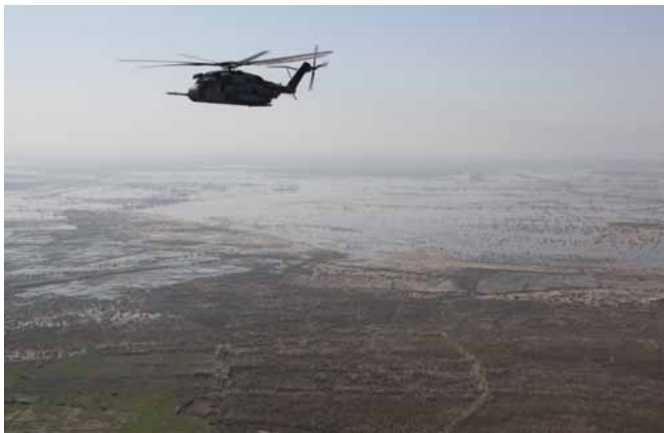
A U.S. Marine Corps helicopter over the flooded region of Pakistan, 2010