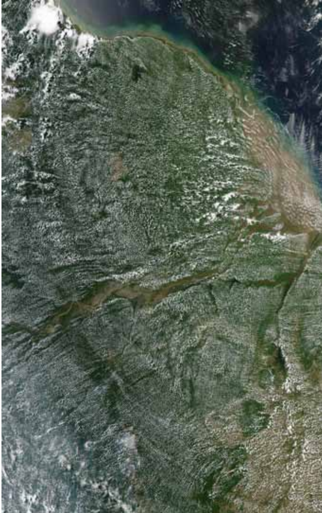
A satellite image of the mouth of the Amazon River in the afternoon, showing how the rainforest creates its own cloud cover each day

to the decline of remaining forest fragments. 32 This would have global implications because, as the world's most significant carbon sink, the Amazon is critical to maintaining climate stability.