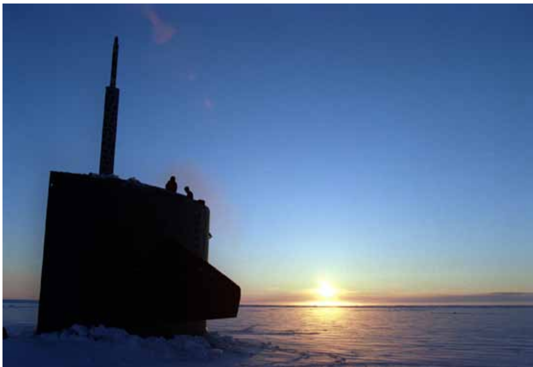
The submarine USS Pogy surfaces through Arctic ice

Ultimately, the trend among Arctic nations appears to be towards cooperation. It is noteworthy that the Arctic Council, a forum of Arctic nations, signed a joint search-and-rescue agreement as their first treaty in May 2011. 49 However, with new players like China and the European Union looking to be involved in this area, there is the potential for conflicts over resources and access.