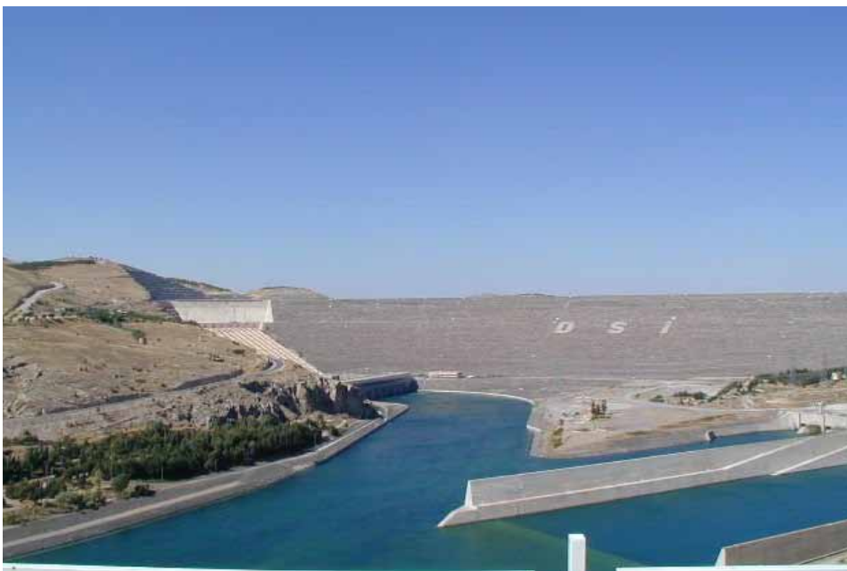
The Atatürk Dam on the Euphrates River in Turkey

Political relationships between these countries have long been tense and the added pressure of naturally occurring droughts and water shortages caused by Turkey's control of water may have political and security consequences in the region. 28