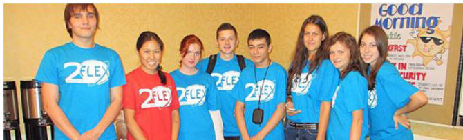
Students from the Future Leaders Exchange (FLEX) program.