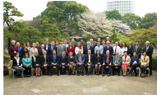
Fulbright East Asia/Pacific Regional conference. Japan was one of the first countries to participate in the Fulbright Program.

This fact sheet outlines the national security benefits of academic exchange, highlights the types of government-sponsored programs, and explores the metrics surrounding these exchanges. This presentation aims to paint a clear picture of academic exchange programs and their benefits for the United States.