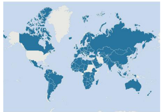
Over 155 countries participate in Fulbright Exchanges.